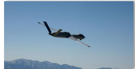
Figure 3 - Autonomous Aircraft

While the idea of integrating AI into training is not necessarily new (Oswalt & Cooley, 2019), recent advancements in this area mean the idea is now becoming closer to reality. Recent demonstrations show the capability of artificially intelligent pilots flying live aircraft (unmanned aerial systems) on an operationally relevant track (ASDNews, 2023). Real-time updates were given to the aircraft and the AI pilot dynamically adjusted to incorporate the revised flight plan and threat data (see Figure 3). Additionally, these missions were flown in conjunction with a “digital twin” aircraft using a LVC system to conduct a multi-objective collaborative combat training mission.