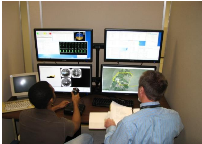
Figure 2: Generic Ground Control Station

The Ground Control Station (GCS) consists of a PC driving four display units. The four displays are generic and can be configured for various crew configurations, such as one UAS pilot, two UAS pilots, or one UAS pilot and one payload operator (Figure 2). The open source software product, HappyKillmore's Ground Control Station, is currently used to create a generic graphical user display including a Google Maps/Earth interface to display the model path and track along with a view of the vehicle. Multiple views are available such as a chase camera view, antenna tracking view, first person view, and overhead view. This GCS software communicates with the simulation computer over an Ethernet interface. State data from the simulation provides position and attitude data to drive the vehicle display and to drive gauges for pilot displays. Waypoints can be provided by the simulation or created at the GCS and modified during flight by the GCS operator. The design of the interface between the GCS and the simulation will allow the generic GCS displays to be replaced with user-defined displays or for the simulation to be operated remotely from a user's GCS via a number of available simulation networks.